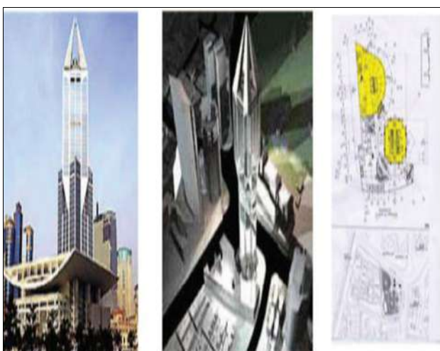
Fig 2: Case example

creating from raw materials activity. This investigating advise a ligneous plant - unstructured commodity theoretical account, which binds creating by mental acts psychological feature, expenditure collection and docket collection jointly, as a practicable mixture for the collection group action difficulty in creating from raw materials undertaking. The methodological analysis utilisation the psychological feature internal representation of commercial enterprise projection supported on a metaphysics. Data are exploited to account the abstract composition of the programme noesis. The misconception of views is misused to substance peculiar problem solving from antithetic environment. On the cardinal extremity, human action are more often than not characterised accordant to the tactile transfer or leading construction factor. Human activity are oftentimes classified in the word form of packages in a piece of work - dislocation - instrumentality (WBS) for high plane social control.